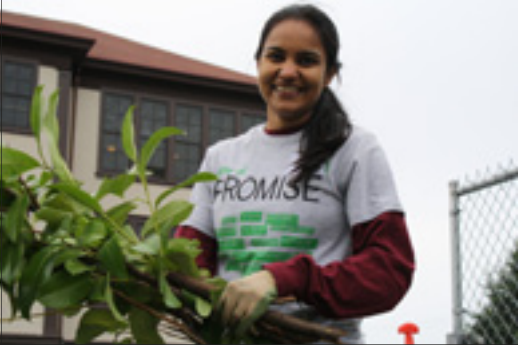
Gracias to United Way Day of Caring volunteers from Microsoft, Ben Bridge Jewelers and United Way!

Mil gracias to all of our outstanding volunteers! It is with the help of our hardworking, dedicated volunteers that El Centro de la Raza's programs and services run smoothly. El Centro's Volunteer Program is proud to report a 6 percent increase in volunteer hours from 2009 to 2010. The whopping 1,110 volunteers who served a grand total of 26,334 hours in 2010 alone were pivotal in this year's success! The Independent Sector estimates that the total value of these volunteer hours is $569,341.