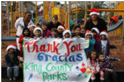
Rain or shine, 123 volunteers and staff, led by Washington Playgrounds, provided over 511 hours of service, showing their labor of love by helping to build our fabulous new playground.