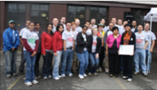
In 2010, over 26,000 hours of service were provided by 1,110 volunteers!

This incredible gift of time, energy and support has allowed our programs to flourish. Our Free Legal Clinics, hosted graciously in cooperation with Schroeter Goldmark and Bender Law and the Latina/o Bar Association of Washington, would not have been possible without the help of 111 volunteers who helped provided 402 hours of translation and assistance.