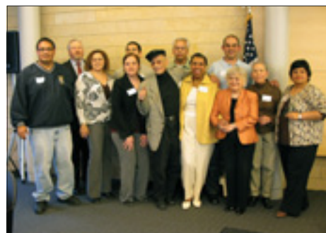
El Centro de la Raza is honored to receive the City of Seattle Human Service Coalition Ron Chism Anti-Racist Award.