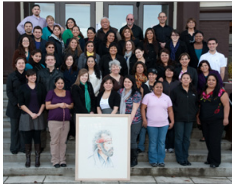
El Centro de la Raza partial staff photo.

*AmeriCorps, Lutheran and Jesuit Volunteer Corps or AARP Staff