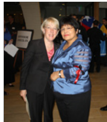
Gracias to Senator Murray for attending the Auction Banquet!