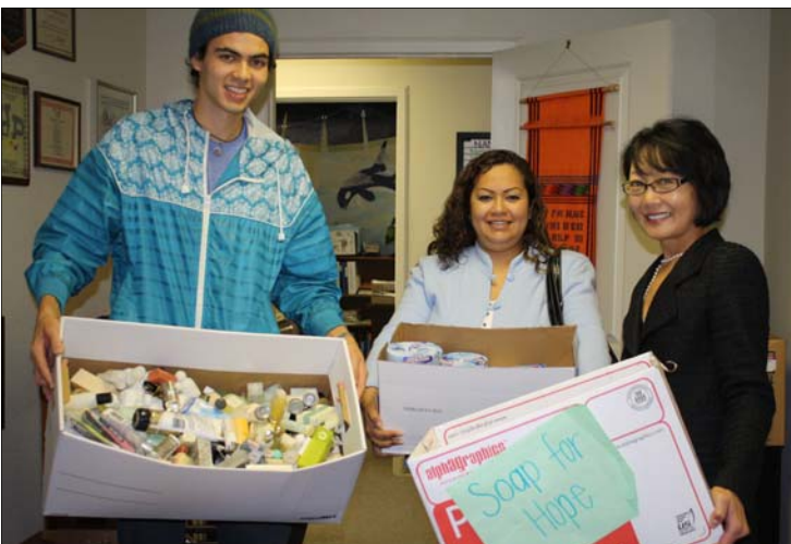
Gracias to AAA for their generous contributions of 735 toiletry items to our children, youth and families this holiday season through the "Soap for Hope" campaign.