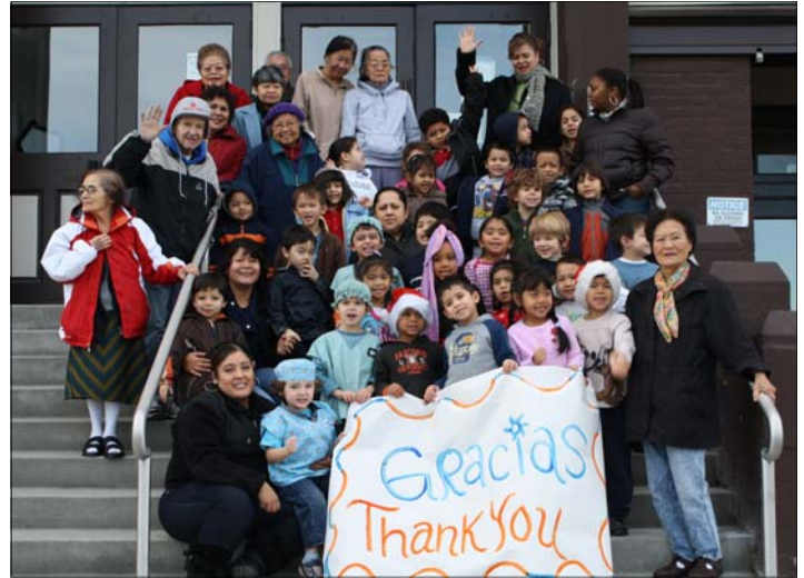
Mil gracias to Mortenson Construction, Architects Without Borders, Engineers Without Borders, and McKinstry for the brand new stairs!

The United Way Day of Caring on September 11th brought together almost 200 volunteers, staff and community members at El Centro de la Raza. Volunteers from Ben Bridge Jewelers, Costco, Microsoft, Nordstrom, PACE Engineering, Peace Health, United Way of King County, and Governor Gregoire herself provided approximately 766 hours of service in one day! The Governor and all our generous volunteers were presented with small tokens of appreciation during a lunch ceremony. Through a project organized by United Way, new stairs are being built for the North, South, and West entrances. Mil gracias to Mortenson Construction, Architects W/O Borders, Engineers W/O Borders, and McKinstry for their generous pro-bono effort. Overall, the project will be saving El Centro de la Raza over $180,000 in necessary repairs. Construction will finish early next year.