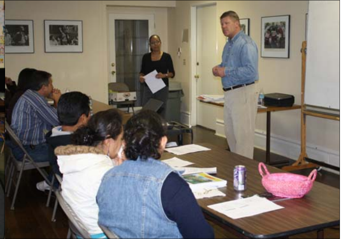
El Centro's Homeownership Center served over 50 families in October through workshops with topics on credit as part of the HomeStreet Bank and Freddie Mac Initiative.