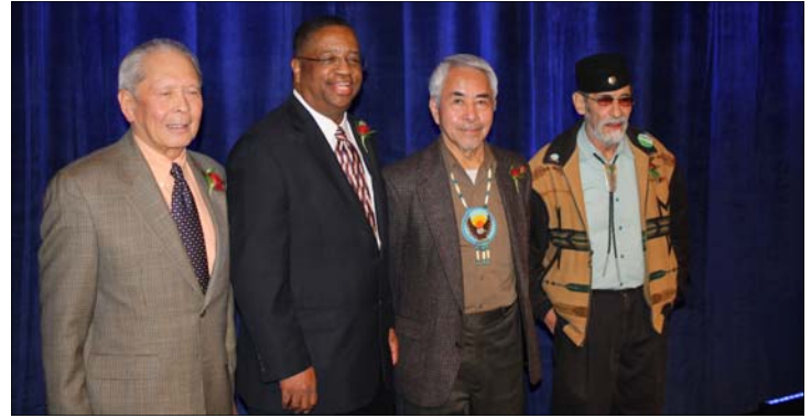
Congratulations to the Four Amigos, recipients of the A.K. Guy Award!