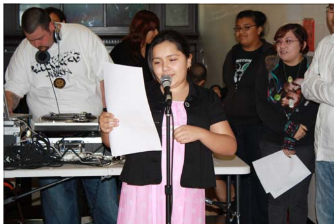
El Centro de la Raza's Hope for Youth program recently paired with middle school students in the Proyecto Saber program at Denny Middle School to create Calavera poetry to display and perform during our Día de los Muertos exhibition.

The program is run as a joint effort with Seattle Public Schools, and classes meet graduation requirements. Hope for Youth promotes positive self-expression, improves academic performance, devel-