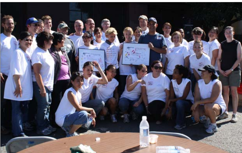
We were honored to have Governor Gregoire volunteer alongside almost 200 staff and volunteers at El Centro on the United Way Day of Caring in September. Gracias to Ben Bridge Jewelers, Costco, Microsoft, Nordstrom, PACE Engineering, Peace Health, & United Way of King County.