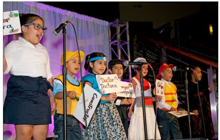
A special gracias to our youth and the Reel Grrls team who made an inspirational video about our youth programs that premiered at the auction.

Mil gracias to our sponsors: Muckleshoot Indian Tribe, Comcast, Eli Lilly, Vulcan, Washington Education Association, HomeStreet Bank, Bank of America, College Success Foundation, Kenneth & Marleen Alhadeff Foundation, Jones & Jones, Teamsters Local Union 760 Yakima, WA, Plaza Bank, and Seattle Sounders FC.