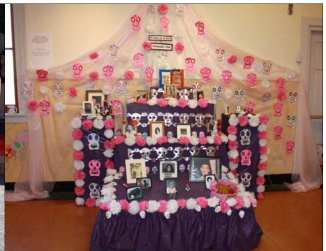
The community ofrenda at our Día de los Muertos exhibit in November honors fallen youth, families and individuals in our community. The exhibit drew over 500 visitors.