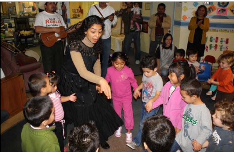
Veracruz-based band, Son de Madera, gave a concert to the children in the José Martí Child Development Center. Here the children learn how to move their feet in the Fandango-style dance.