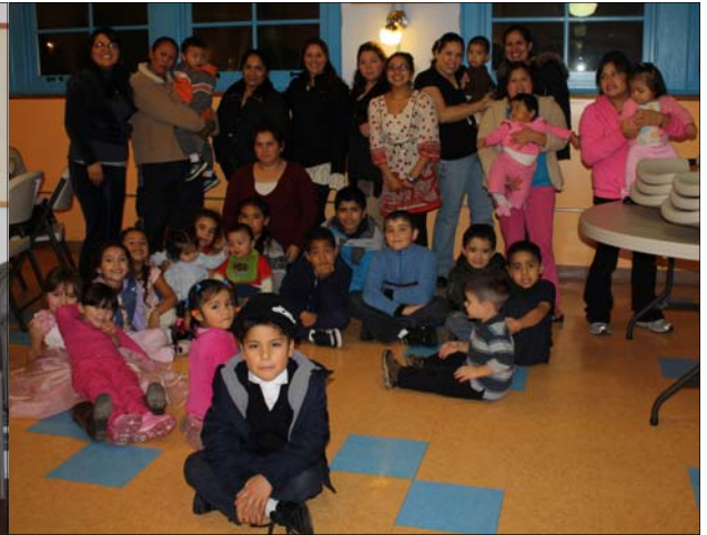
The Comadres prevention and support group celebrates the holiday season with a party at El Centro! The group meets bi-weekly to talk about family issues.