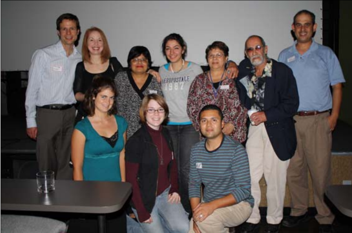
Gracias to Comcast, the youth team from Reel Grrls, and the team mentor who produced an inspirational four-minute fundraising video about our youth programs that premiered at our auction!