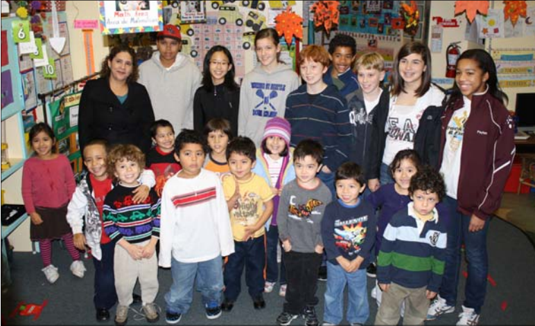
Seventh and eighth grade students from Lakeside School donate bilingual books to the child development center students at El Centro. The generous Lakeside students also volunteer throughout the year.