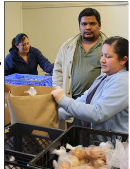
The Food Bank recently expanded from being open two to now three days during the week.