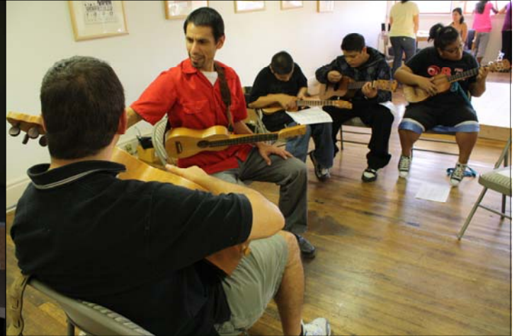
The Seattle Fandango Project and the Veracruz-based band Son de Madera held bi-weekly musical workshops with youth ages 11-17 for five weeks at El Centro de la Raza.