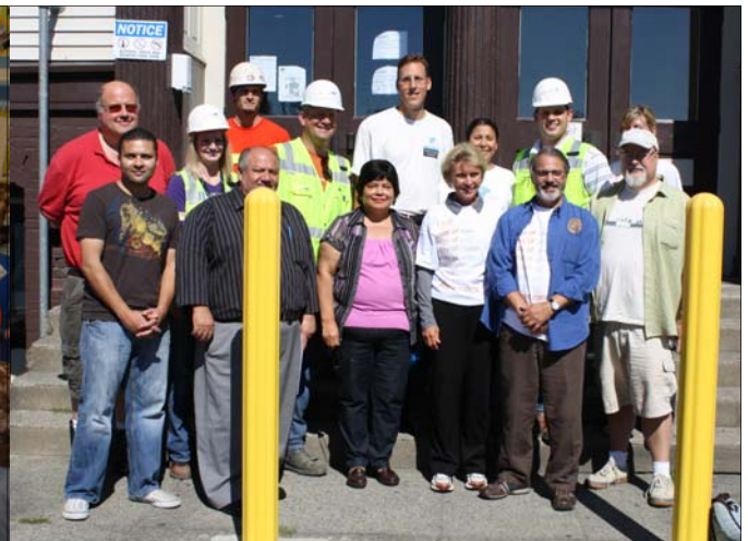
Mil gracias to Mortenson Construction, Architects Without Borders, Engineers Without Borders, and McKinstry for their generous pro-bono stair renovation project, saving El Centro $180,000.