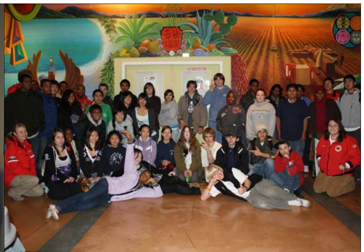
In partnership with City Year, over 40 youth participated in volunteer projects at El Centro de la Raza in November. Gracias to all the wonderful youth and to City Year for their continued support!